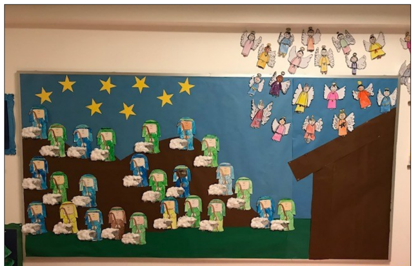
I am sad to see the Christmas season end. Love these two Christmas bulletin boards.

Please note the Catholic Schools Week schedule on page 2 and information about the special lunches.