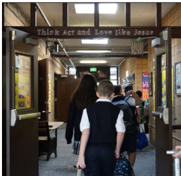
Looking forward to seeing this again!

All students are checking the Specialist Google Sites (PE, Music, Library, and Drama Troupe).