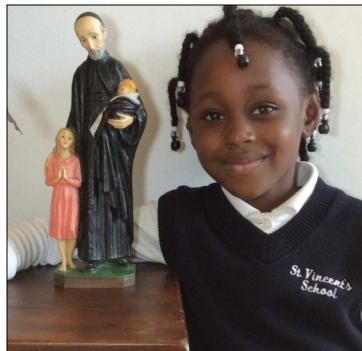
St. Vincent de Paul, pray for us.

All students are checking the Specialist Google Sites (PE, Music, Library, and Drama Troupe).