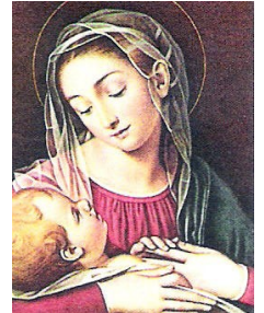
Sweet Mother Mary, pray for our students.

Hail, Mary, full of grace, the Lord is with thee; blessed are thou among women, and blessed is the fruit of thy womb, Jesus. Holy Mary, Mother of God, pray for us sinners, now and at the hour of our death.