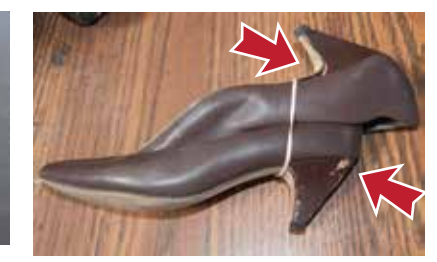
· Heel is broken and too worn to be usable