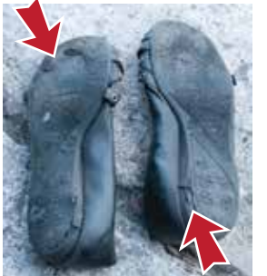
Soles are too worn and not wearable