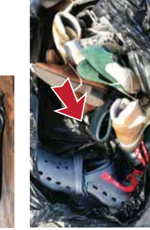
Not rubber banded or tied