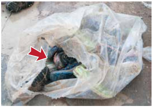
• No wet shoes